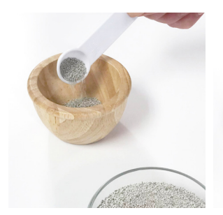
Measure Desired Amount

InstaMask™ granules are hard, but when water (or an aqueous booster) is added in a 1:1 ratio, the granules will hydrate and soften becoming a soft paste that can easily be applied on the face. The granules should hydrate for a minimum of 2 minutes before mixing.