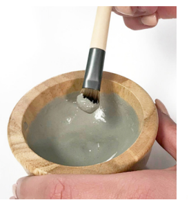
Ready to Apply