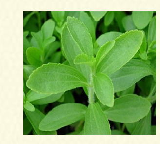
STEVIA Well known for its energetic value , rich in many active compounds